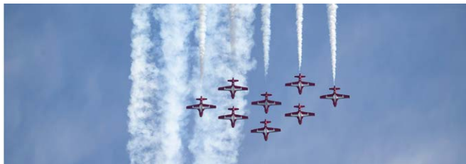
Almost 140K visitors came to Barrie's 2024 Airshow, resulting in a total economic impact of $11.3M.