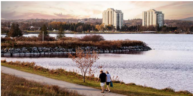
Over 631K overnight visitors contributed $112.8M to Barrie's local economy in 2024, a 79.5% year-over-year growth of economic impact.

Invest Barrie markets the city as a top domestic and foreign investment destination, positioning it as competitive for talent, tourism, and business opportunities.